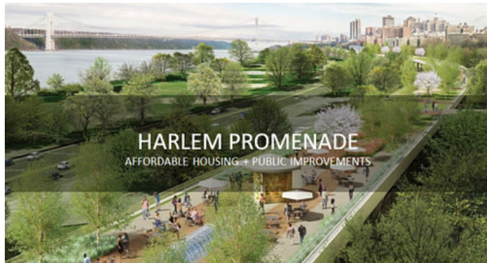
West Harlem Special Purpose District Broadway from 123 rd Street to 158 th Street

Is Harlem the next locale to seriously undergo talks of reinventing infrastructure for public use? DNAinfo reports that there's chatter of bringing a High Line-inspired elevated park to a portion of Amtrak line near the West Side Highway. The park, known as Harlem Promenade , would connect the community with the nearby Hudson River waterfront and could also bring a hefty amount of affordable housing to the neighborhood: air rights from over the track could net up to $170 million to help construct the park while also allowing developers operating inside the creation of a special district to build up to 2,000 units of affordable housing in the underserved neighborhood, DNAinfo reports . The special zoning district would stretch from 123rd to 158th streets on Broadway and would require developers to dedicate 50-percent of housing as affordable and allow them to build up to 16 stories. Currently, the neighborhood is zoned for building up to 12 stories.