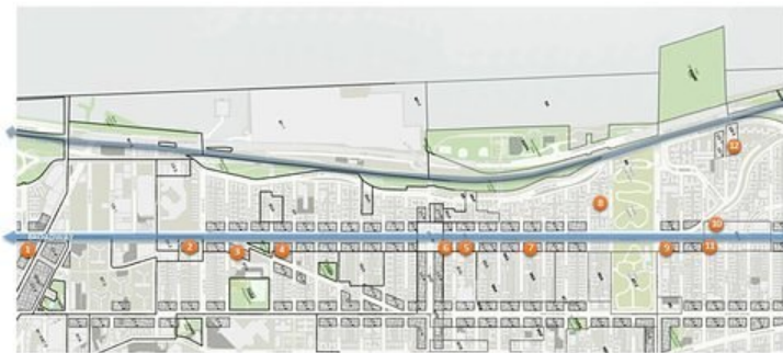
Potential Receiver Sites for Affordable Housing West Harlem Special Purpose District